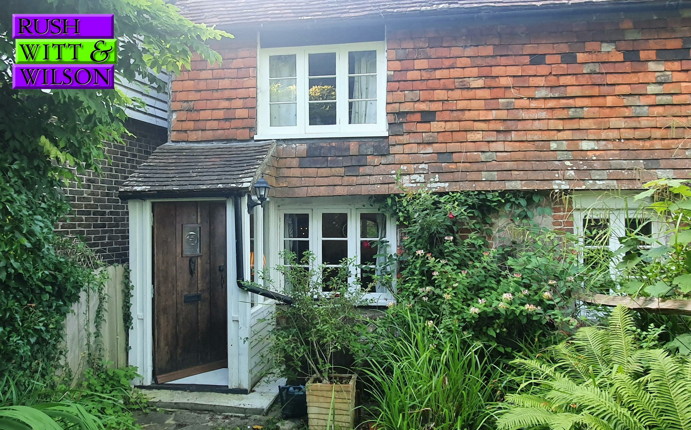
Little Malt Cottage The Strand, Winchelsea, East Sussex TN36 4JT Guide Price £415,000